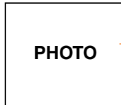
Photo of member or person authorized to make purchase

THE BUSINESS CLASSIFICATION CODES ON THE FACE OF THIS CARD INDICATE THE TYPES OF MERCHANDISE WHICH THIS MERCHANT MAY BUY FOR RESALE. THE MERCHANT IS NOT ENTITLED TO PURCHASE ITEMS FOR THEIR OWN USE UNDER THE RESALE PROVISIONS OF THIS CARD. THE FULL LISTING OF BUSINESS CLASSIFICATION CODES AND OTHER PERTINENT INFORMATION ARE CONTAINED IN PUBLICATION NO. 32 "TAX TIPS FOR SALES TO PURCHASERS FROM MEXICO." THIS CARD IS ONLY VALID IN THE STATE OF CALIFORNIA. PUBLICATIONS AND INFORMATION MAY BE OBTAINED BY CONTACTING THE SAN DIEGO CALIFORNIA DEPARTMENT OF TAX AND FEE ADMINISTRATION OFFICE PHONE 1-888-385-4700.